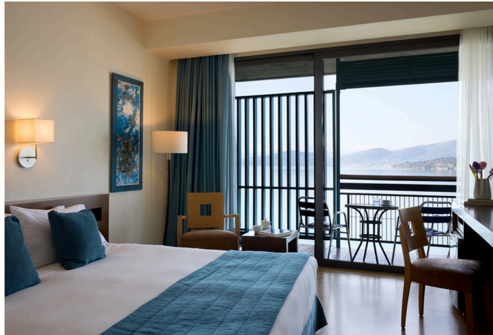
27 Sea View Rooms