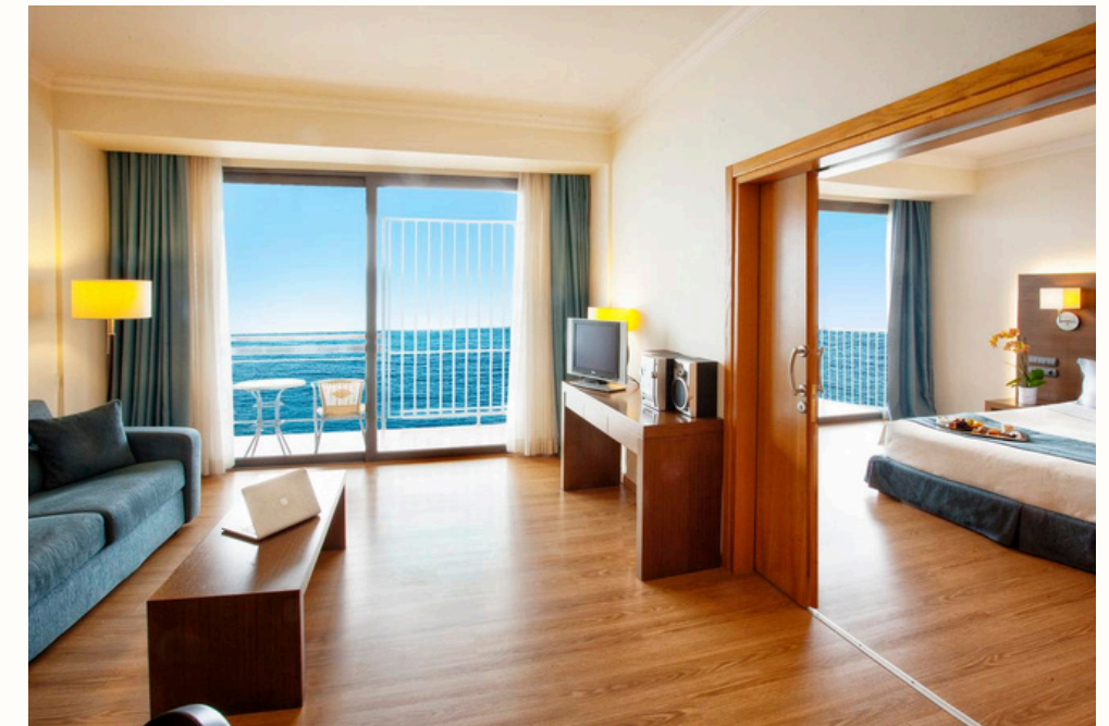
2 Presidential Suites