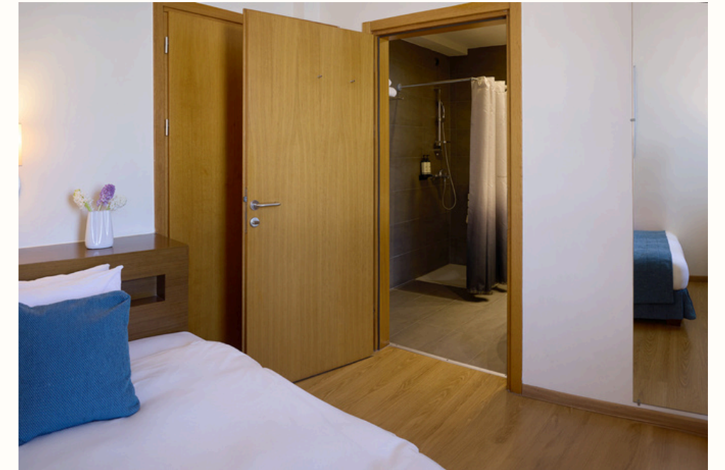
4 Accessible Rooms