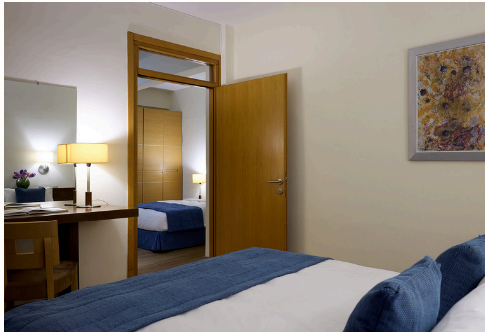
2 Family Rooms City View