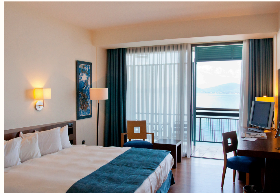
2 Junior Suites