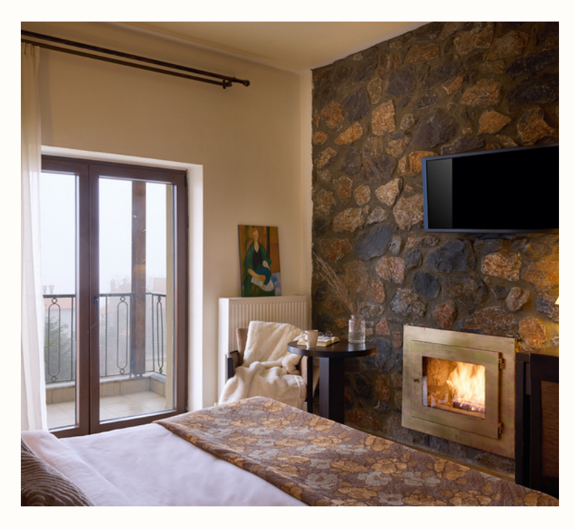
11 Standard Double Rooms with Eco Fireplace