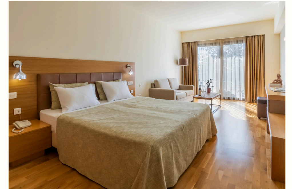
6 Family Executive Suites