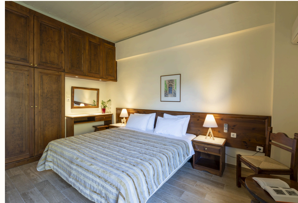
60 Standard Rooms