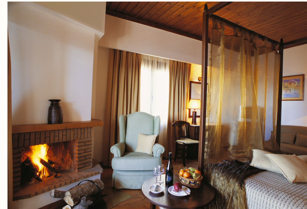
12 Mini Chalet Suites