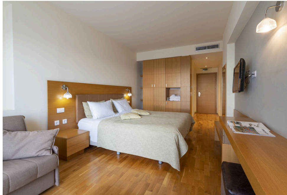
17 Executive Rooms