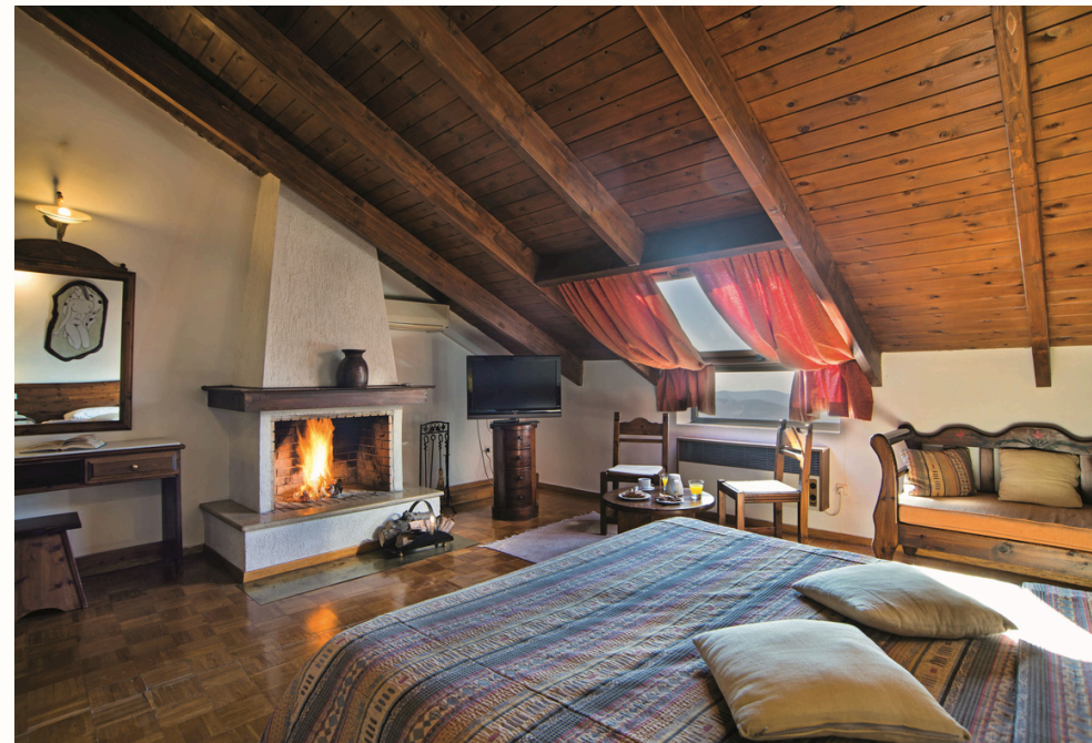
5 Family Chalet